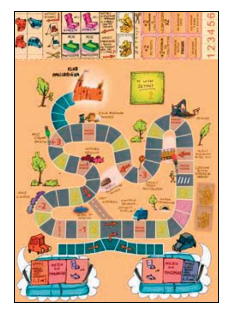
Fot. 7. Leaflet