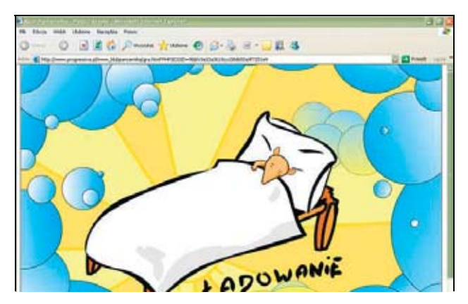
Fot. 6. Interactive game