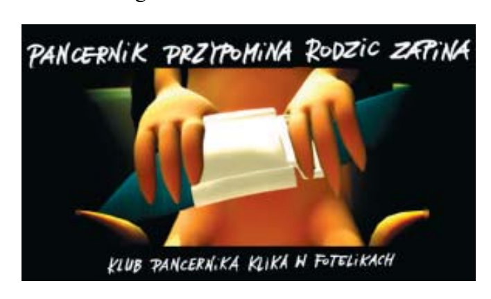
Fot. 2. Shot from TV-Spot

We are seating with no worries We are admiring the world It is very funny Sitting just like that We are getting into the car We are sitting in the chairs We are belting up In the Armadillo Club You drive always belt up Armadillo Club Always Belt Up