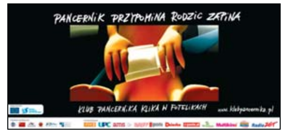
Fot. 3. Posters