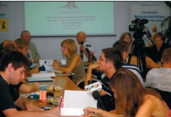
Fot. 1. Press conference