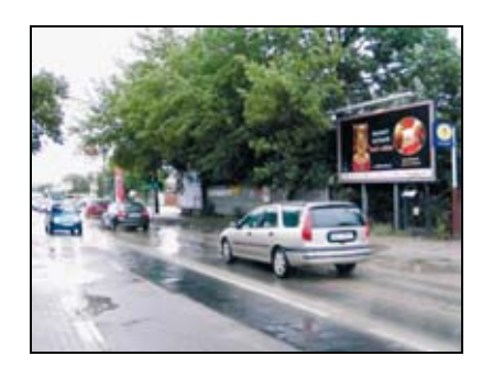
Fot. 4. Billboards in Polish cities