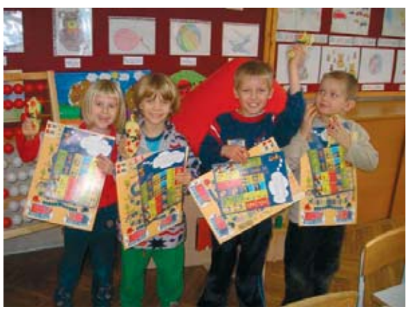
Fot. 8. Actions in kindergartens and schools